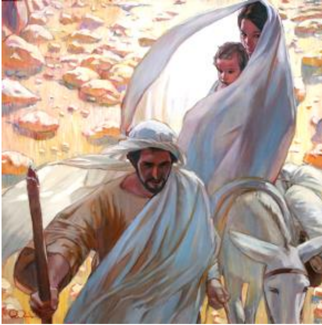
The Nightmare After Christmas